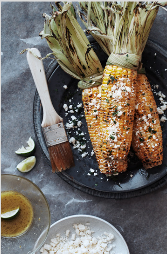
Grilled Corn with Feta & Lime Vinaigrette. You can find the recipe HERE .

On Fridays' Social Cultural Studies, they will learn about Central and South America; its current residents and the traditions (and foods) of the indigenous people.